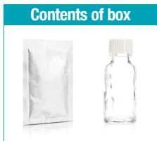
- White sachet of powder - Glass vial of vaccine